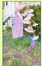
The Becoming Tree with messages of hope for the future.