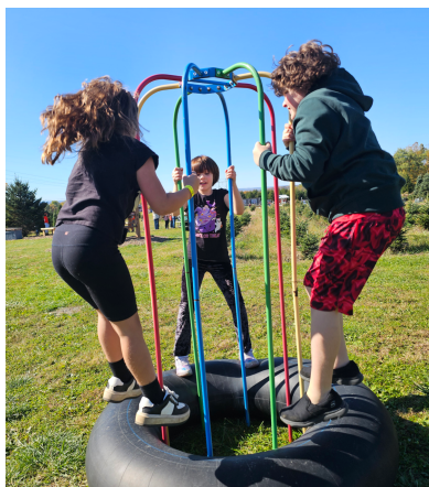
RE October fun at Moore Family Farm

Special music by Ithaca Children and Youth Chorus