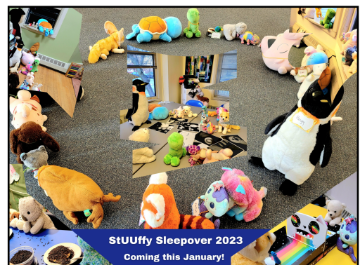
StUuffy Sleepover 2023 Coming this January!