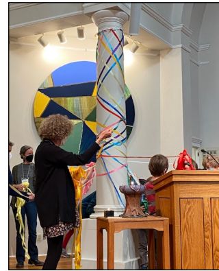
Creating the Maypole at the Sunday Celebration on May 1st.

If you are unable to attend Sunday services in person, we invite you to watch the Live Stream at 10:30 am on our YouTube Channel and join us for a "Zoom Coffee Hour" following service. You can use the Zoom link or the meeting ID of 240-797-976.