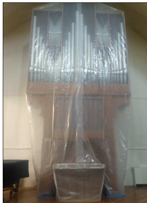
The organ is currently wrapped in plastic to protect it during the Sanctuary repair project.